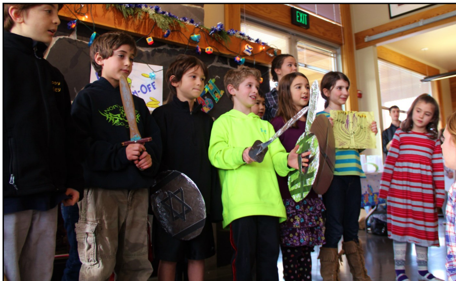
The Maccabees are on the scene during class presentations at the annual Hanukkah party Dec. 21, 2014. For a gallery of photos from the Beth Israel event, go to www.bethisraelbellingham.org

Our party fundraising series continues with Rabbi Samuel's sushi rolling party just around the corner. These events are proving to be a fantastic way to raise