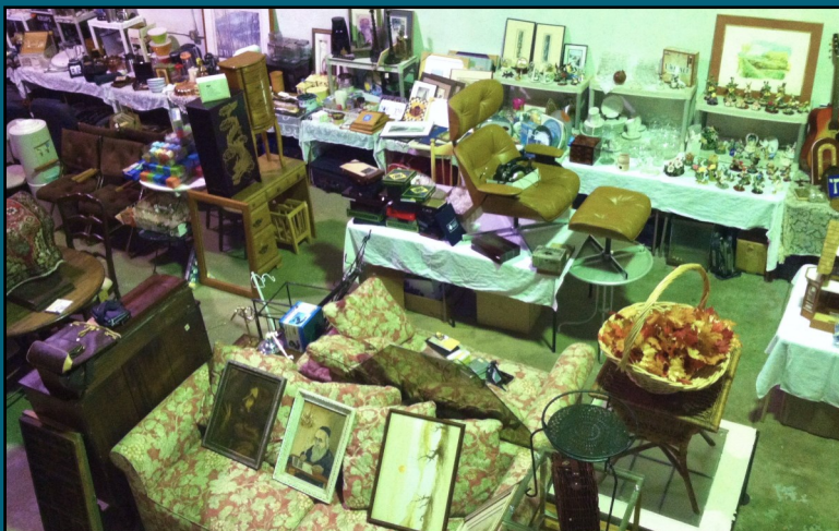
The warehouse on Division Street was packed with items for the Raise the Roof sale Dec. 13-14, 2014. Leftover items were donated to charities..