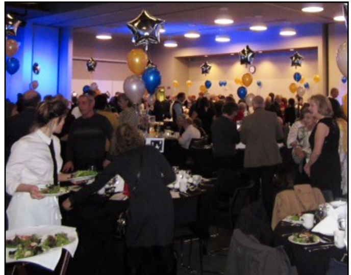
Settlemyer Hall is abuzz with energy as more than 200 guests mingle during the Silent Auction.