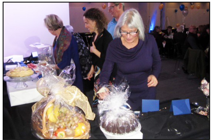
Dessert Dashers scramble to get their choices