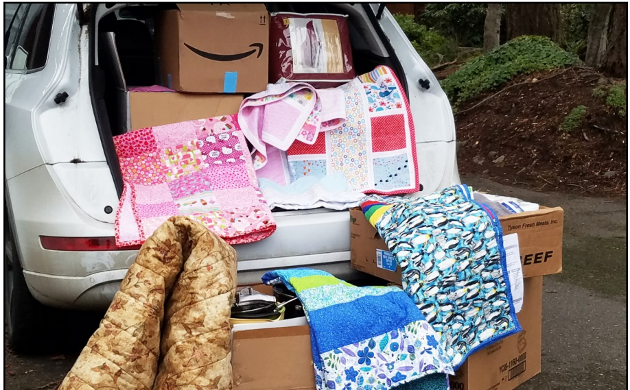
Kitchen and bathroom boxes filled with donations from the Beth Israel community on their way to Jewish Family Services in Seattle in January, 2017.