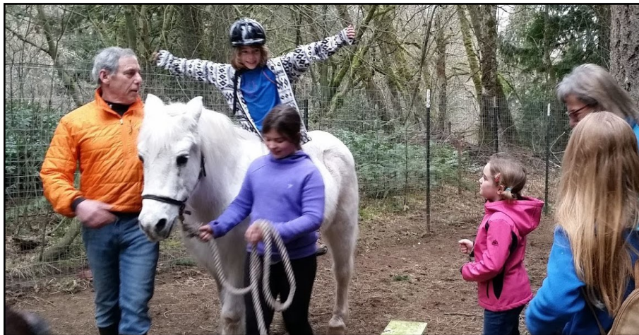
The Judaism, Animals, and Us group spent time at family farm learning about how Judaism guides us when we care for animals.

This format of Jewish learning enabled the children to experience the relevance of Jewish learning to their