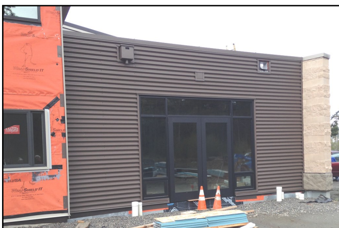
Above, the west side of the new building, showing the retaining walls and the religious school entrance. At left, the east side showing the doors to the library.