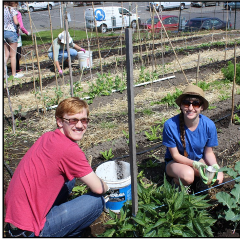
Helping in the garden on Mitzvah Day 2014.