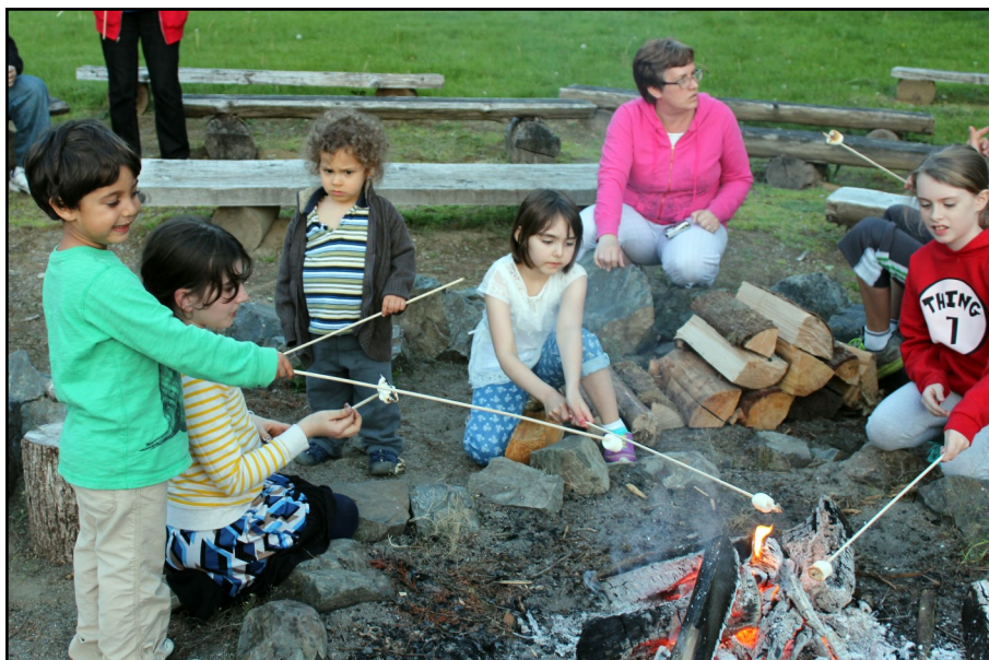
Mesmerized by the campfire and roasting marshmallows (Lag B'Omer 2014).

In an age when friends are counted on our Facebook page and our popularity is monitored on Instagram by