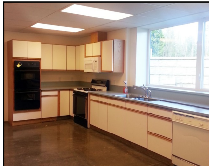
The Keshet kitchen on the lower level is complete, except for a refrigerator.

We are continuing planning for exterior work, such as drainage, patios and sidewalks that will enable us to gain an occupancy permit and move in this fall. Until the outside work is complete, which is expected sometime in August, some interior items are on hold, such as carpeting the main and